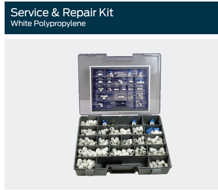
Service and repair kits include the following: