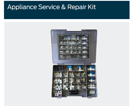
Service and repair kits include the following: